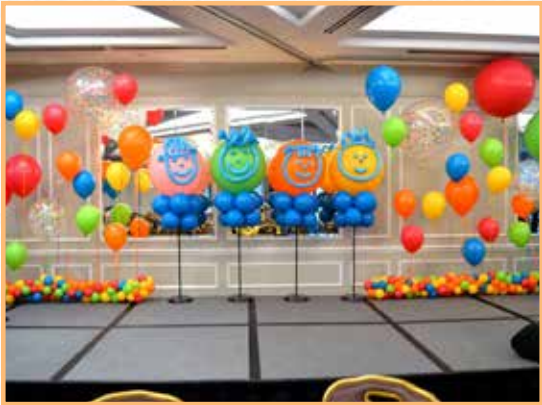
2018's Cherishing Childhood luncheon. 1